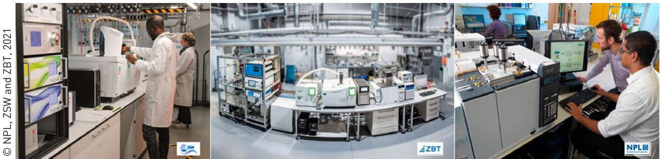
3 analytical laboratories ready for Hydrogen quality ISO 14687

Strengthened European hydrogen sector through filled-in knowledge gaps