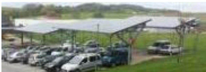
Générateur Photovoltaïque (40 kW)